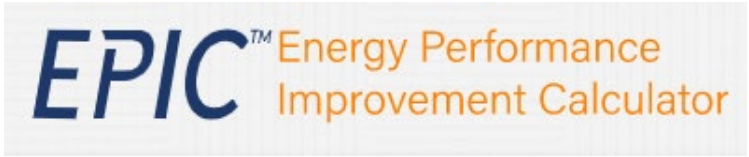
Exhibit I: EPIC User Interface for Scenario Comparison